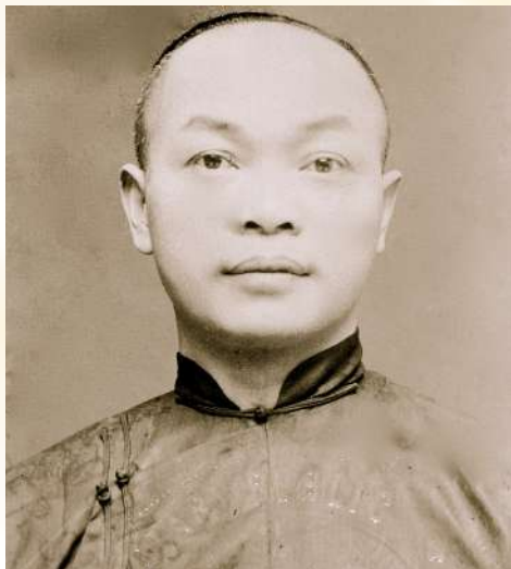
Photo: Wong Kim Ark, 5/14/1904.

In the years since then, the Supreme Court has reaffirmed that undocumented immigrants and their children are “subject to the jurisdiction” of the United States. In its 1982 decision in Plyler v. Doe , which held that undocumented children have a right to an education under the Fourteenth Amendment, the Supreme Court observed that there is “no plausible distinction” 33 between documented and undocumented immigrants in regard to jurisdiction, as both are “subject to the full range of obligations imposed by [the location’s] civil and criminal laws.” 34