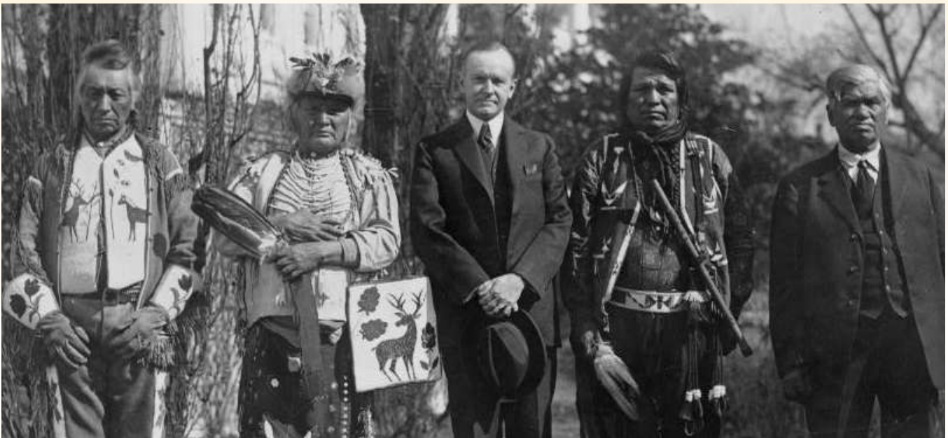
Calvin Coolidge First Administration, Herbert E. French, National Photo Company, v. 2, p. 41, no. 34318, National Photo Company Collection, Library of Congress

Through the 1924 Indian Citizenship Act, Congress granted citizenship to all Native Americans born within the territorial limits of the United States. 40 The new law meant that Native Americans were no longer required to shift allegiance from their tribe to the United States as the law recognized that such dual allegiance was not a conflict. 41